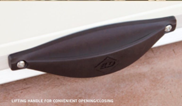
LIFTING HANDLE FOR CONVENIENT OPENING/CLOSING