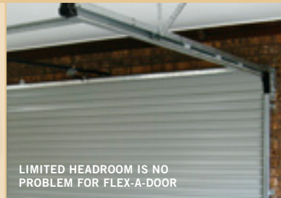
LIMITED HEADROOM IS NO PROBLEM FOR FLEX-A-DOOR