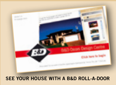
SEE YOUR HOUSE WITH A B&D ROLL-A-DOOR