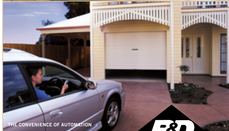
THE CONVENIENCE OF AUTOMATION