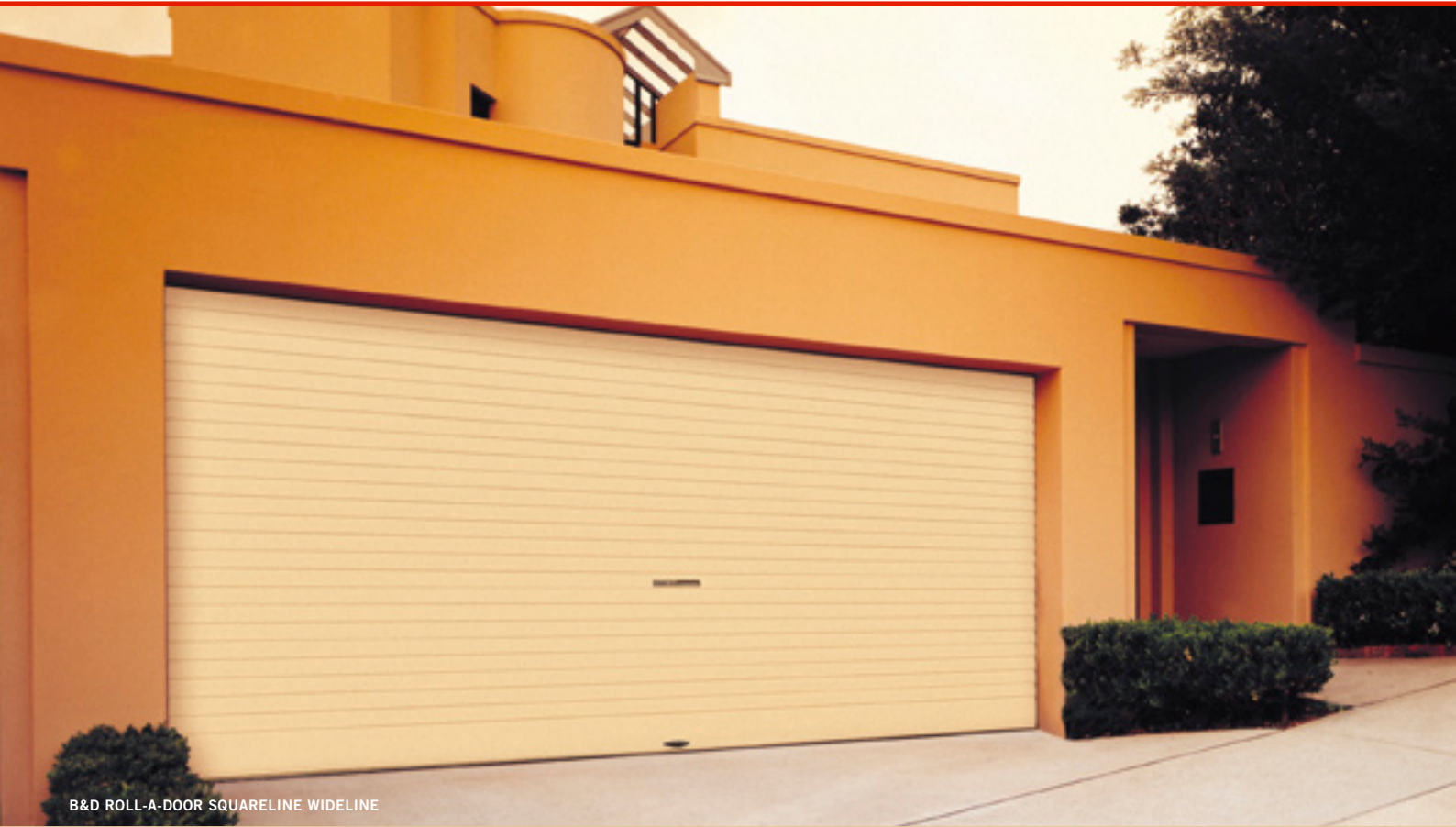
B&D ROLL-A-DOOR SQUARELINE WIDELINE