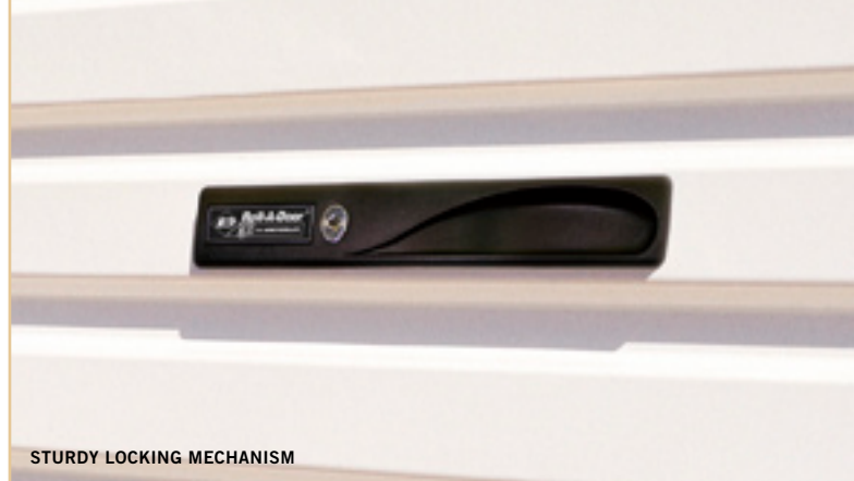
STURDY LOCKING MECHANISM