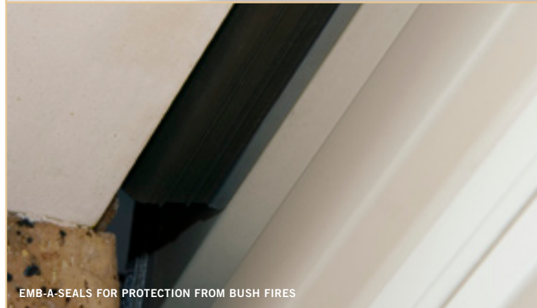
EMB-A-SEALS FOR PROTECTION FROM BUSH FIRES