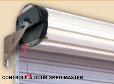
CONTROLL-A-DOOR SHED MASTER