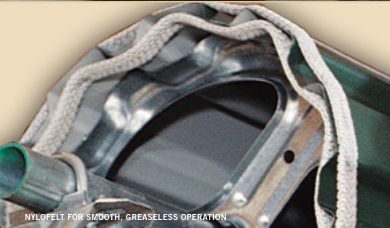
NYLOFELT FOR SMOOTH, GREASELESS OPERATION