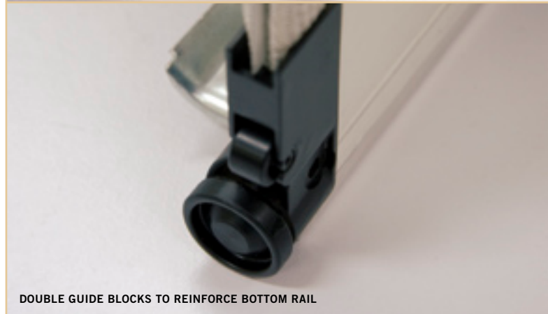
DOUBLE GUIDE BLOCKS TO REINFORCE BOTTOM RAIL