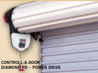
CONTROLL-A-DOOR DIAMOND PD – POWER DRIVE

Do you want all the benefits of a B&D door, but don't have the headroom for a normal garage door? Try a B&D Flex-A-Door®. It's the perfect alternative when you are looking to replace your existing tilt door, or in situations where you have restricted headroom in your garage or carport. For more information visit www.bnd.com.au .