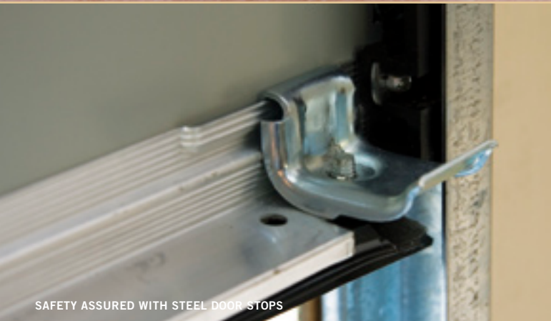
SAFETY ASSURED WITH STEEL DOOR STOPS