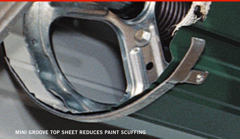
MINI GROOVE TOP SHEET REDUCES PAINT SCUFFING