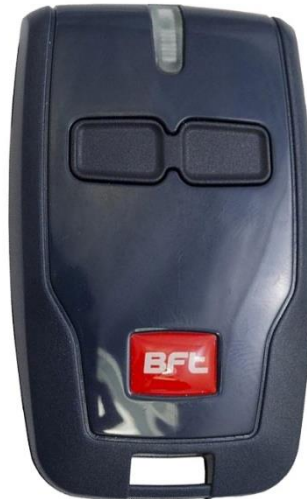
Genuine Mitto RCB02