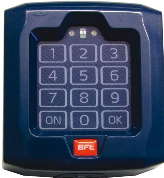
Genuine Q.Bo Wireless Keypad