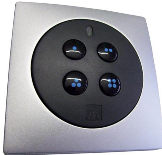
Genuine RB Wall Button