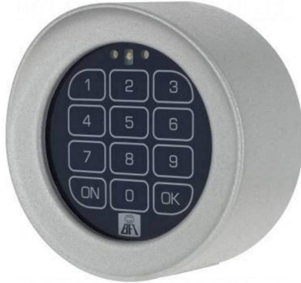
Genuine T-Box Wireless Keypad