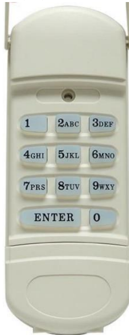
Genuine wireless keypad