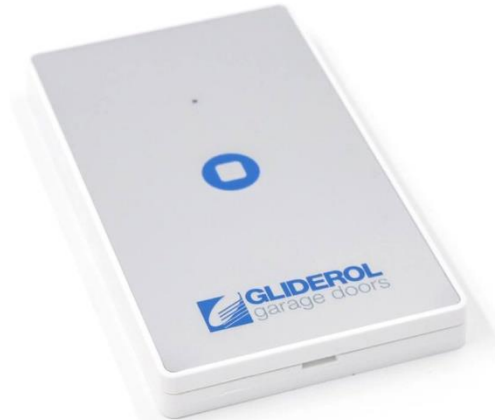
Genuine G+ Wall Button