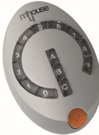
Genuine DS1 Wireless Keypad